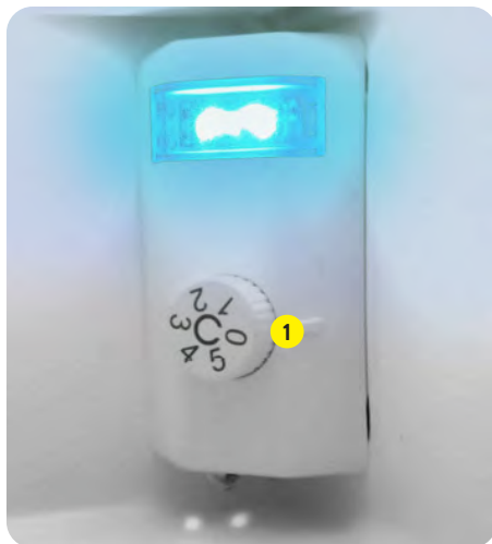
1. Refrigerator temperature adjustment knob