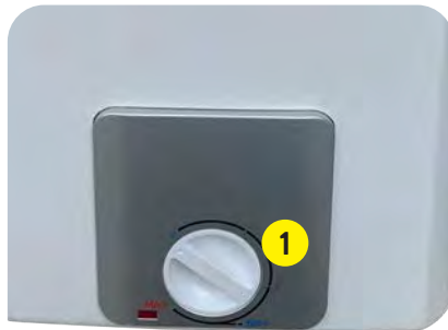
1. Temperature control